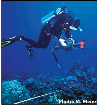
An LTER investigator photographs reef organisms for quantitative analysis.

Coral reefs have immense ecological value. Not only do they rank among the top of all ecosystems with respect to annual total gross productivity, coral reefs support the highest species diversity of any marine habitat, containing, for example, about one third of all species of fish. Coral reef ecosystems can be affected by perturbations ranging from short-term and relatively localized disturbances, where return to the original state is possible, to more chronic, widespread influence of shifts in climate over decades that may fundamentally alter the ecosystem.